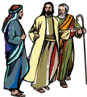
On the Road to Emmaus